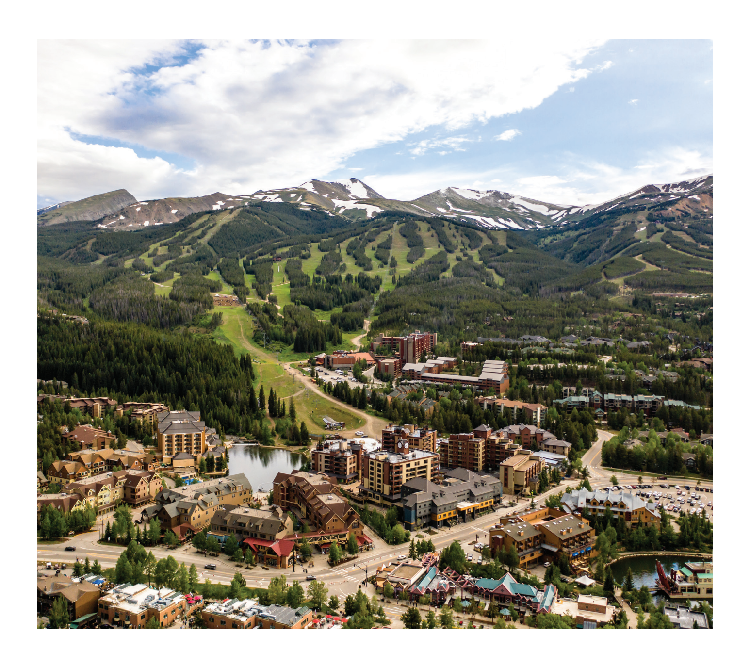
Summit County Market Report