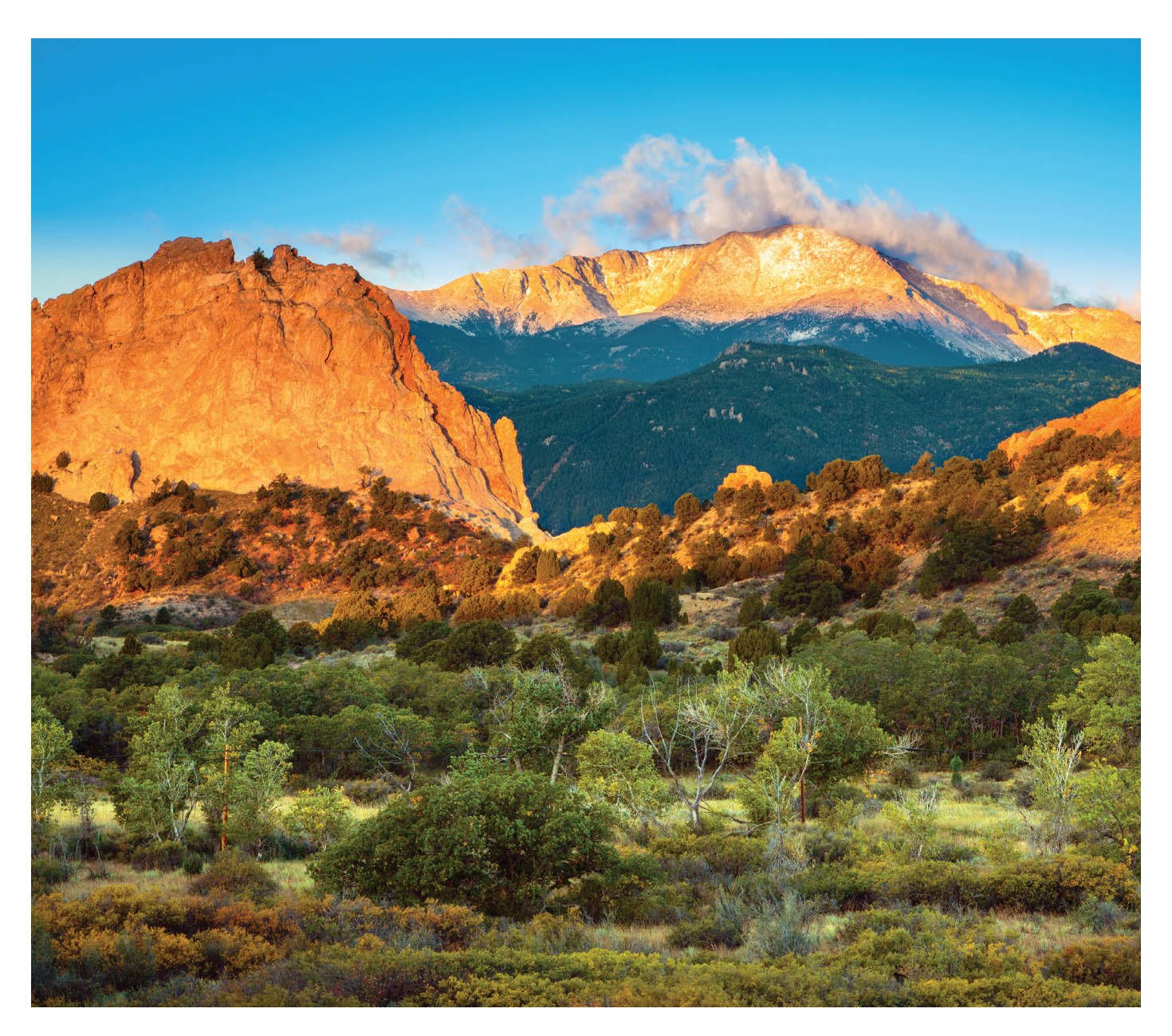
Colorado Springs Market Report